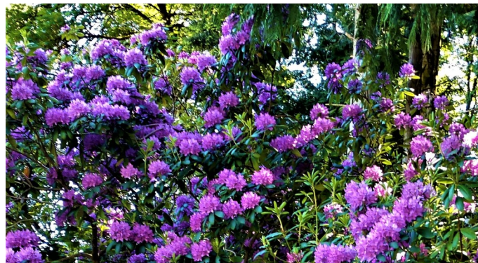
Rhodys at Bloedel, May 2021

You can assist in spreading the word about DKG and the Alpha Sigma Chapter by sharing this newsletter with former members, teachers in your school (or former school), and other educators you think might make good DKG members. Make as many copies as you want and distribute them to individuals; put them in faculty lunchrooms; add a copy to a basket of fruit or plate of